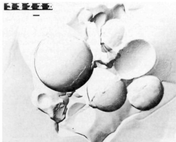
Figure 1. Freeze fracture EM micrograph of vesicle preparation. Vesicles were formed instantly by swelling PL film deposited on a silicon wafer in excess water. Bar indicates 100 nm.